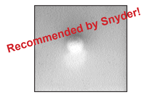
HDLPE exposed 6 months in 16.5% NaOCL. 400 ft. pounds @ -40 degrees F.